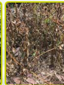
24 hours later