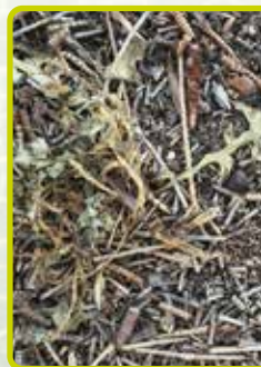
24 hours later